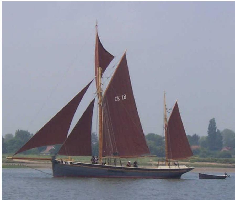
Two masted Smack