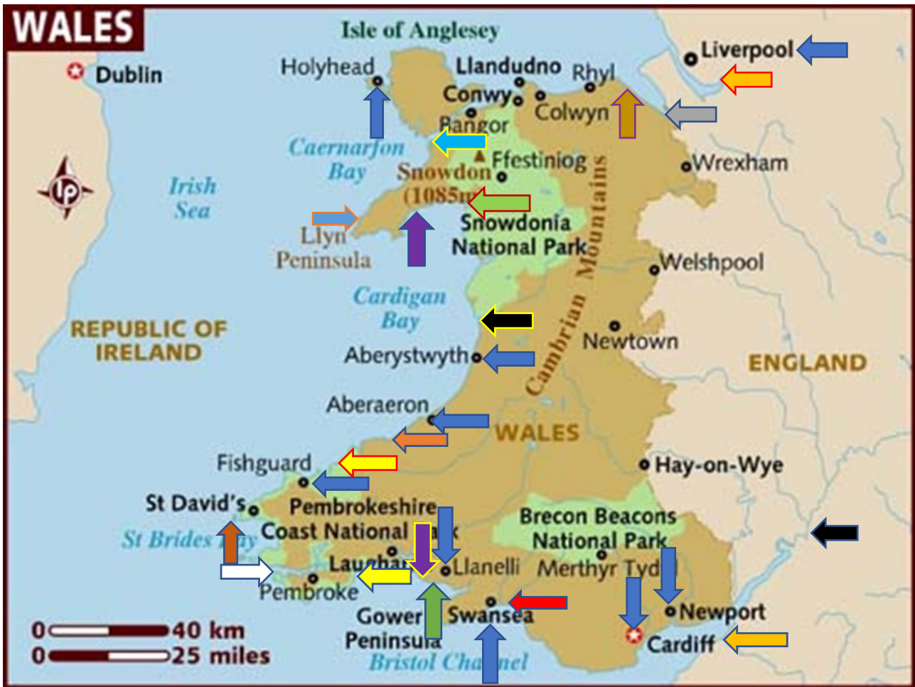
Fig. 3 Map of Wales showing Ports