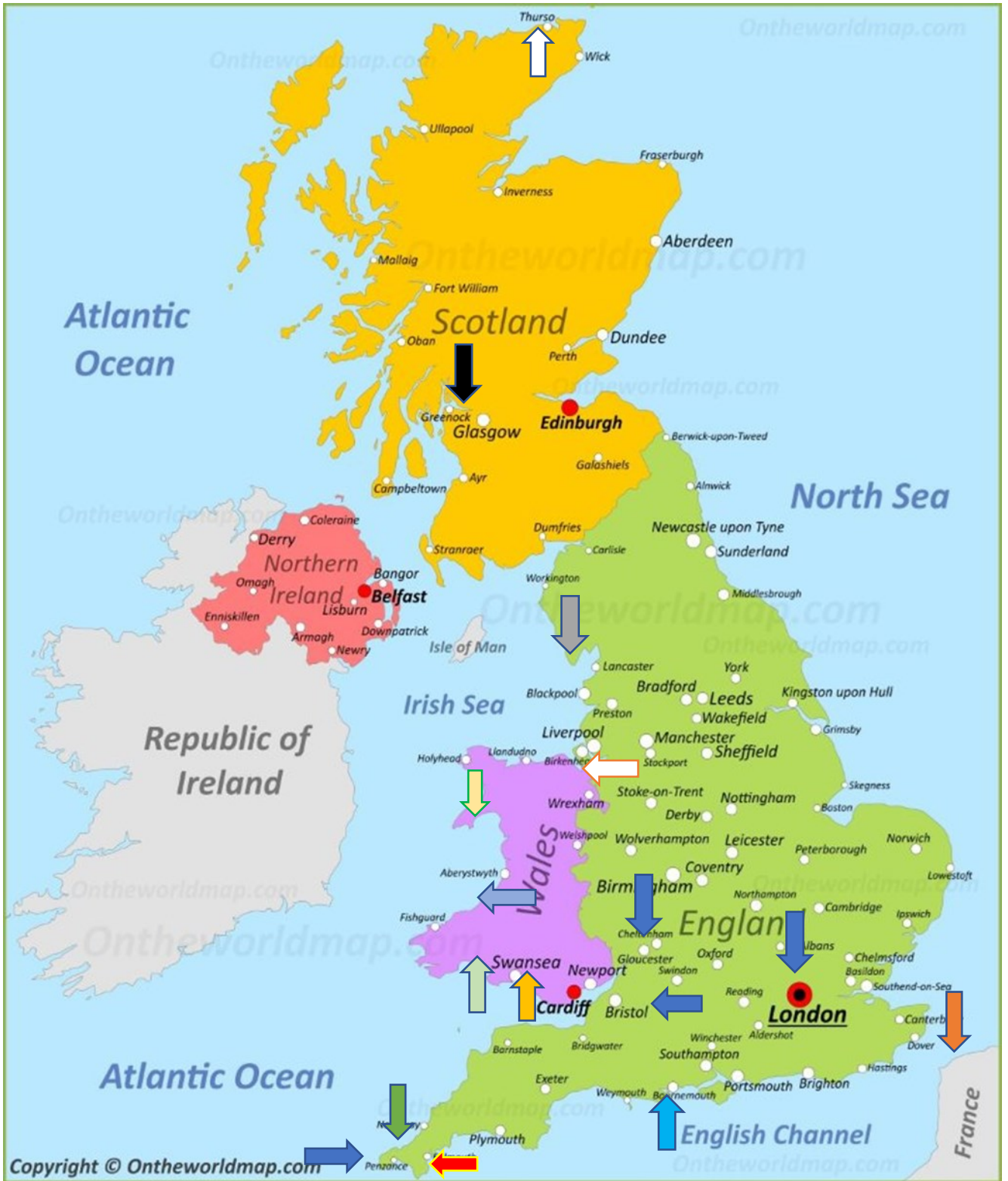
Fig. 4 Map of the United Kingdom