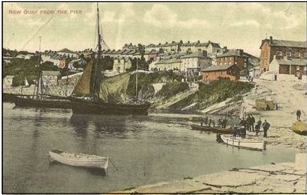
A Dandy in Newquay Harbour