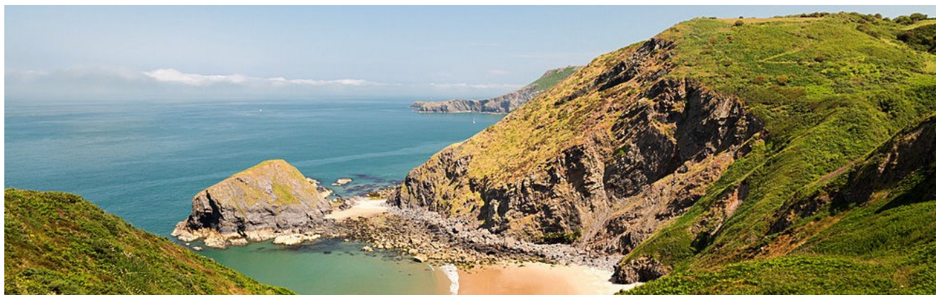
Fig. 1 Cwm Tydu beach