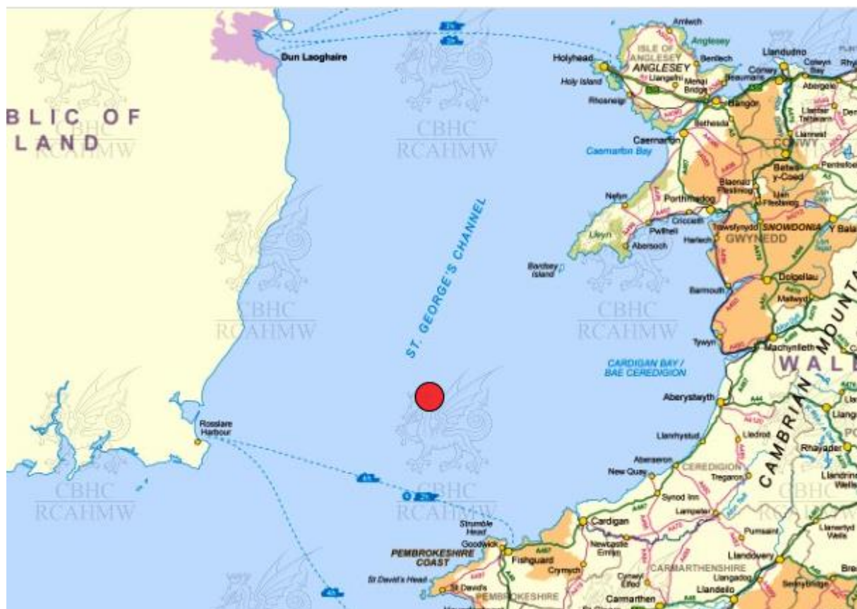
Fig 1: Location of SS Argos Sinking (as reported)

In Nov 1907, the SS Argos enroute from Liverpool to Buenos Aires sank during a storm in the Irish Sea approximately 13miles west of the Cardigan Bay Lightship (Fig 1). The captain and crew of 6 were saved by the steamer Griqua.