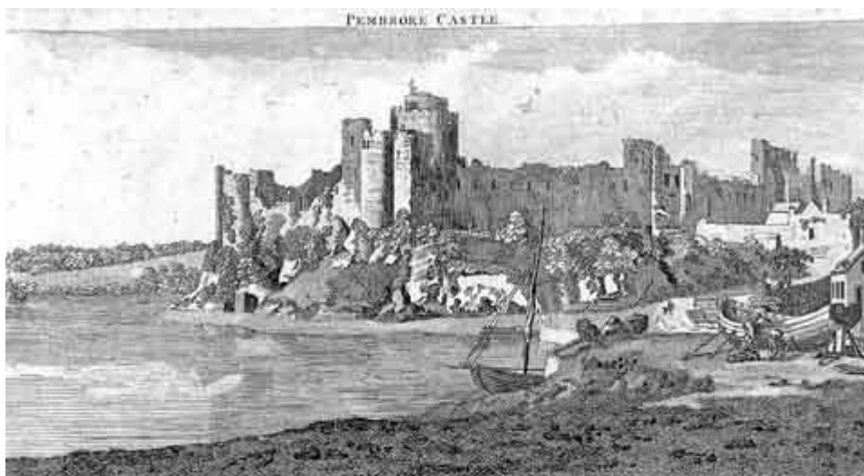
Fig.2 Cunnigar shipyard, an engraving by Paul Sandby, 1778.