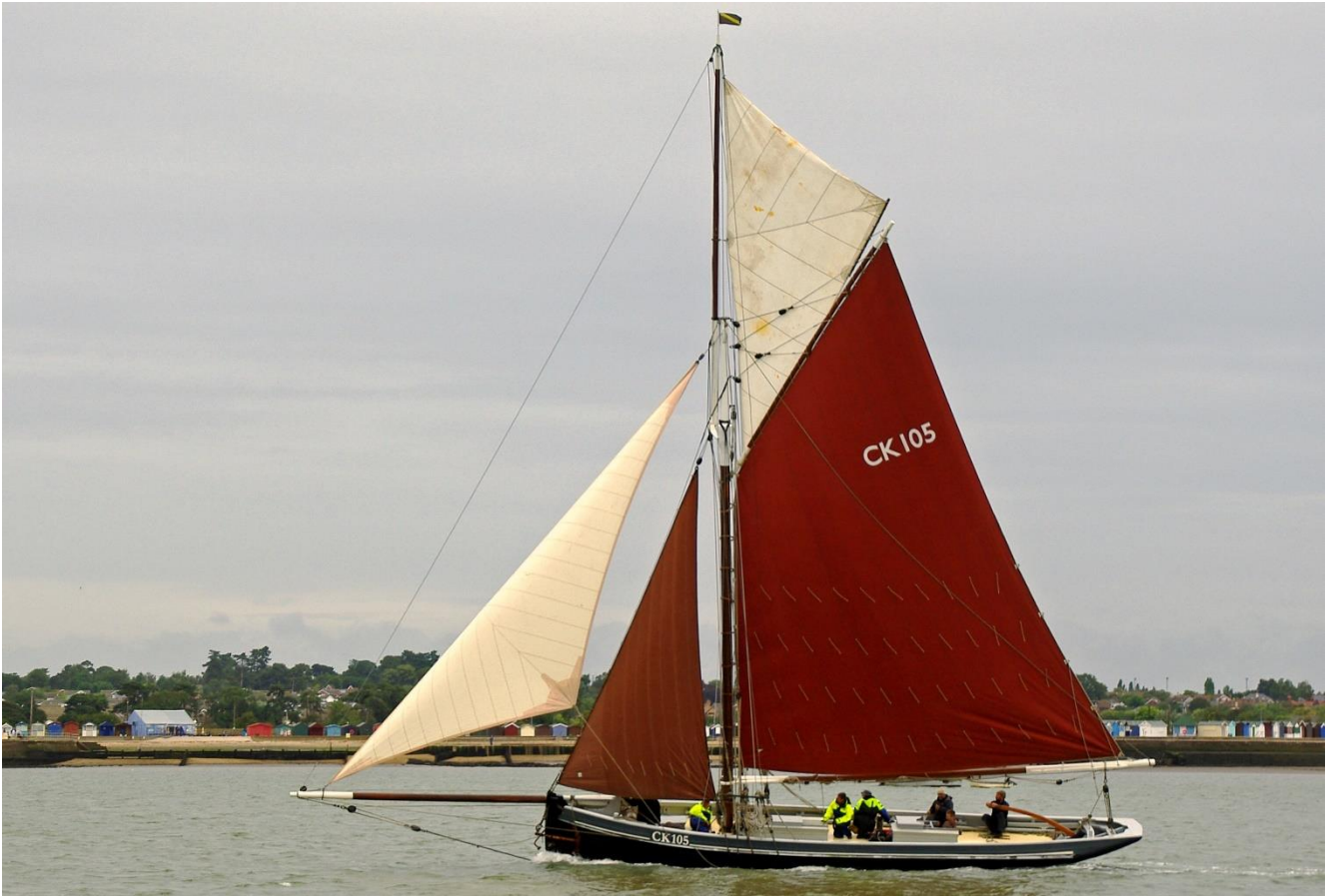
Fig. 3 A modern picture of a smack under sail, built in 1912