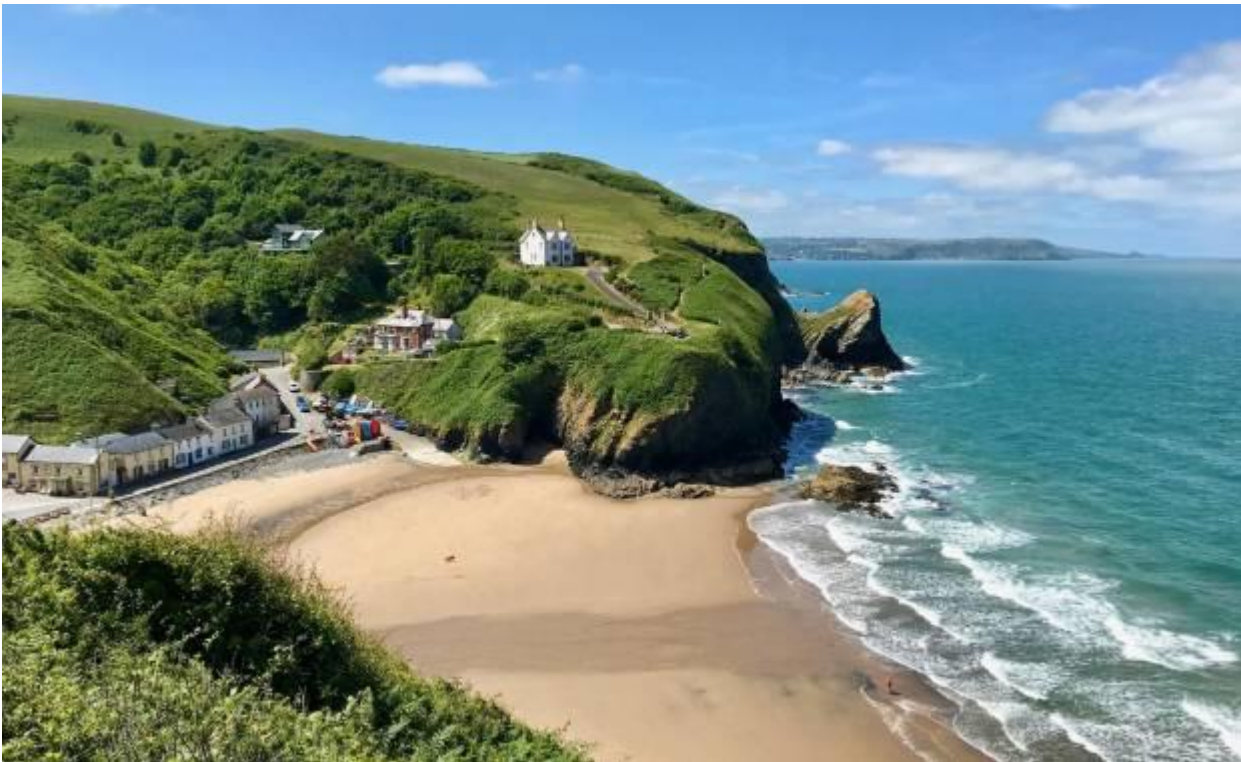
Fig. 3 Llangrannog beach where Christina unloaded

Whitehaven is a port on the west coast of Cumbria historically in Cumberland, it lies by road 38 miles south-west of Carlisle