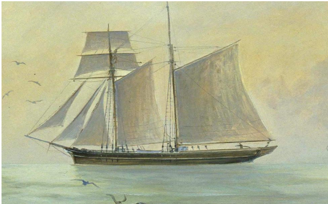
Two masted Schooner built at Aberaeron in 1856