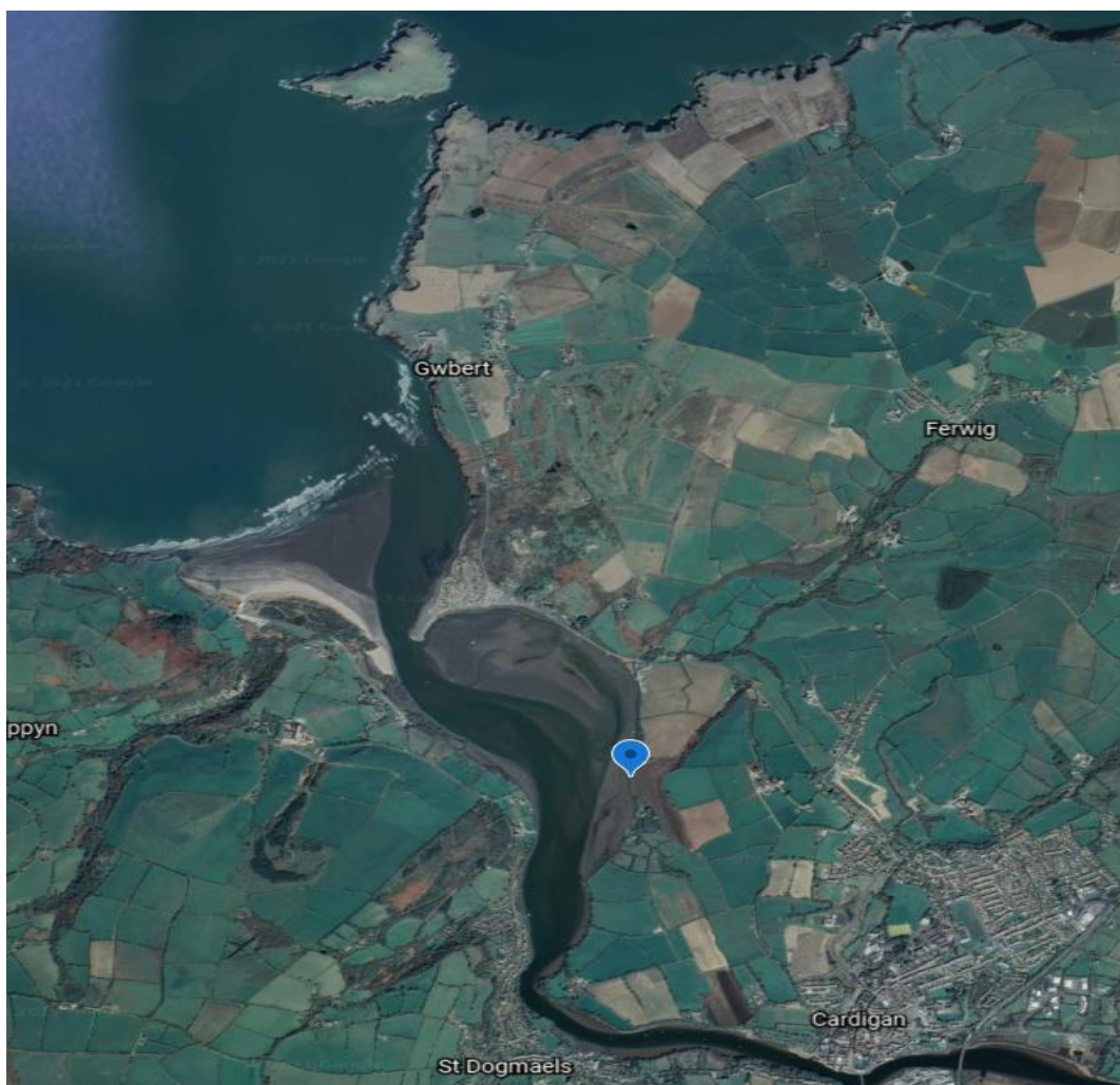
Fig 2: Location of Cupid Grounding, Jan 11 1895

On Jan 11 th 1895, the Cupid ran aground and sank approximately 1 mile inside the bar at Cardigan. The Cupid was refloated, repaired, sold and renamed Esperanza.