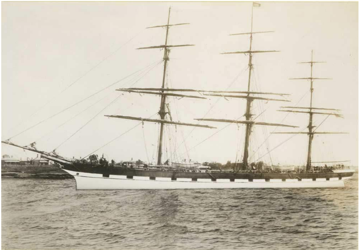
The schooner City of Madras (later re-named Duke of Connaught and fitted with a 4 th mast)