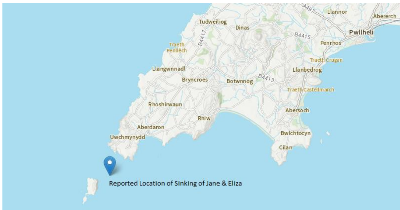
Fig 2: Location of Jane & Eliza Sinking, Oct 19 1885

On Oct 19 1885 while sailing from Port Dinorwic Wales for Milford Wales with a cargo of slate, the Jane & Eliza sank in Bardsey Sound.