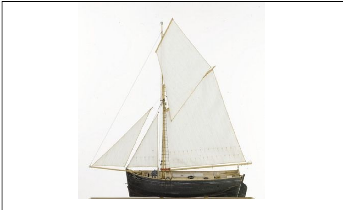
A cargo Smack